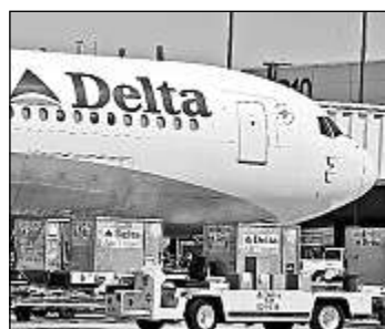
Calgary Herald Archive Fair France and Delta said Wednesday they plan to share transatlantic routes

The Air France and Delta venture is the biggest deal yet to follow a transatlantic Open Skies pact reached by the United States and the Euro-