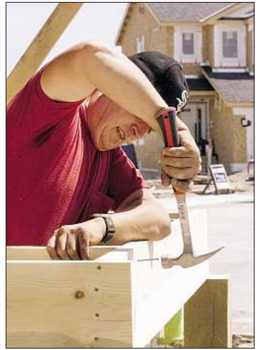
A worker helps build a house in Calgary.

Nationally, urban starts last month totalled 22,031, an increase of 44 per cent from a year earlier.