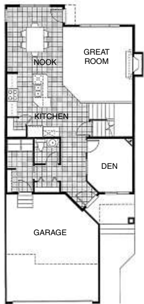
MAIN FLOOR 944 SQ. FT.

Cranston truly is something refreshing on the landscape. On a site that was once homesteaded by the Cranston family, this new community in Calgary's southeast is rapidly taking shape. Perched on a majestic ridge overlooking the Bow River, Cranston offers spectacular views of the mountains, downtown Calgary and the river valley below. The community is also conveniently located just minutes from many of Calgary's best recreational opportunities, like Fish Creek Park, Sikome Lake and McKenzie Meadows Golf Course. And even though Cranston is surrounded by natural splendour, it still offers easy access to downtown, via Deerfoot Trail.