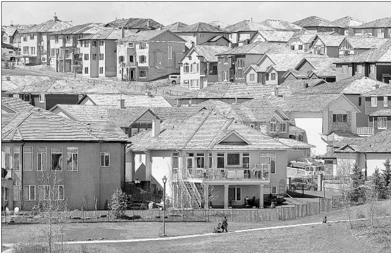
Calgary is just behind Toronto, at $11 billion, and Greater Vancouver, at $6.5 billion, in total dollar volume of residential sales for the first four months of the year.

“The strong momentum for resale housing market activity this spring builds on its record-breaking performance in the first quarter,” said CREA chief economist Gregory Klump. “There has been anecdotal evidence that resale activity in some Western markets is getting a boost from a