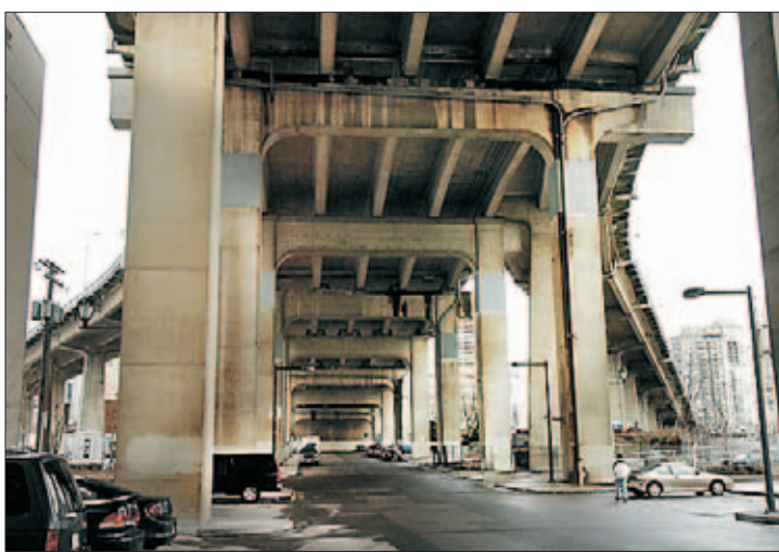
The land under the downtown end of the Granville Bridge could go from this 'urban wasteland' to a vibrant neighbourhood core.

"What we want to encourage is not only a new retail centre, but also a new, vibrant public