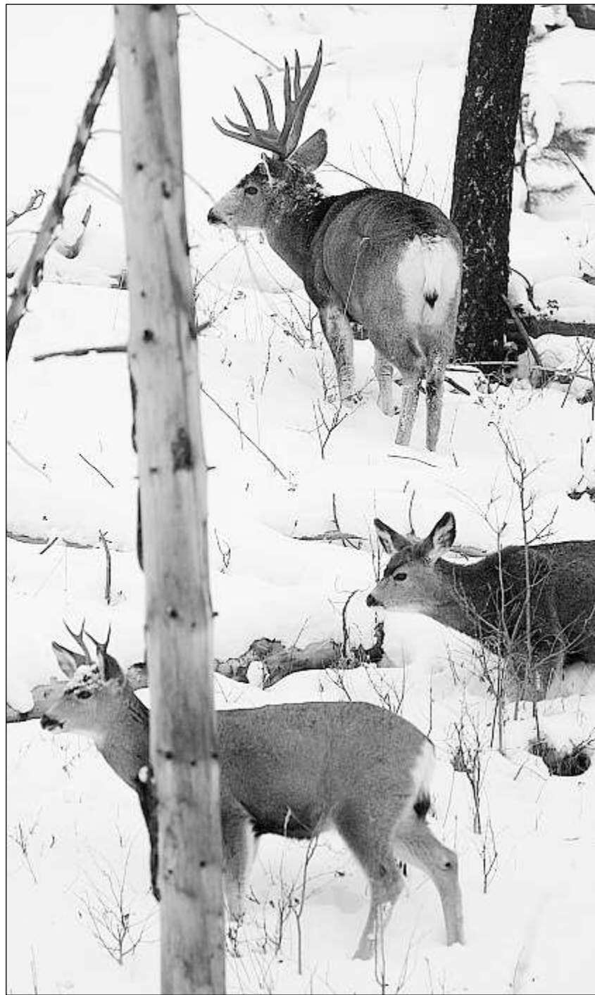
Deer browse for food along Highway 1A, just north of Banff in an old prescribed burn area, on Sunday.