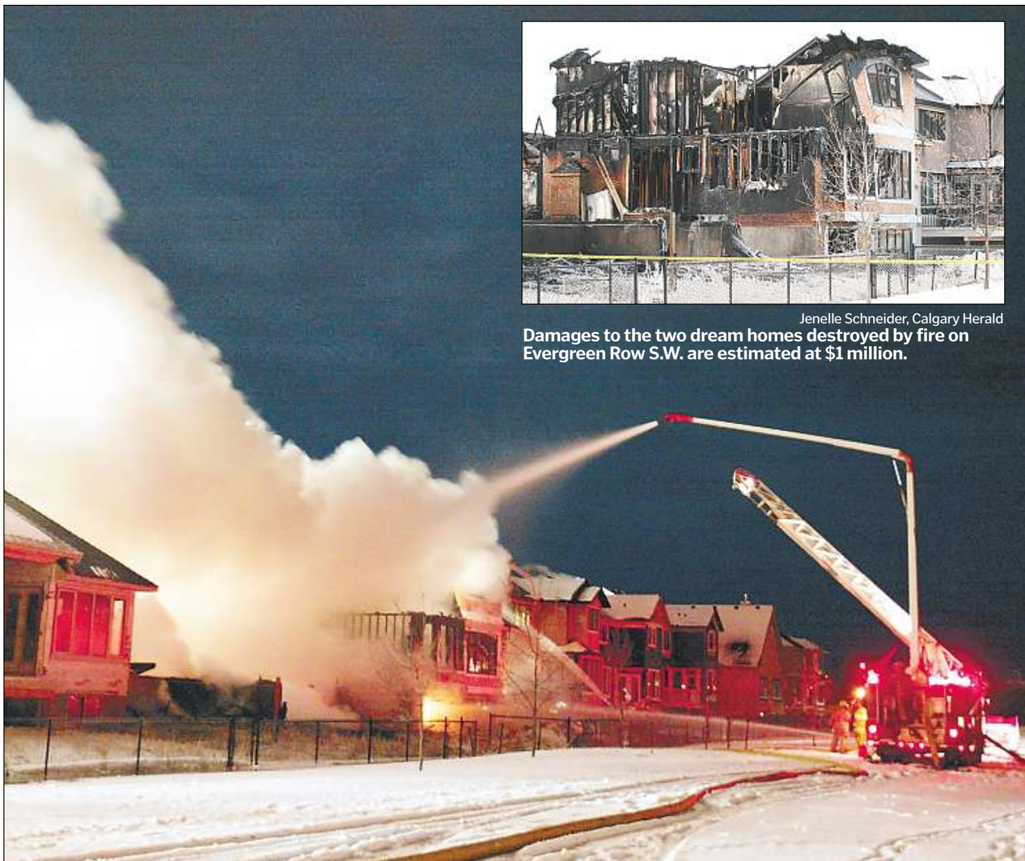
Damages to the two dream homes destroyed by fire on Evergreen Row S.W. are estimated at $1 million.